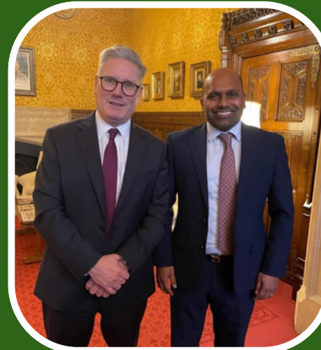
With the Prime Minister after discussing local issues facing the constituency