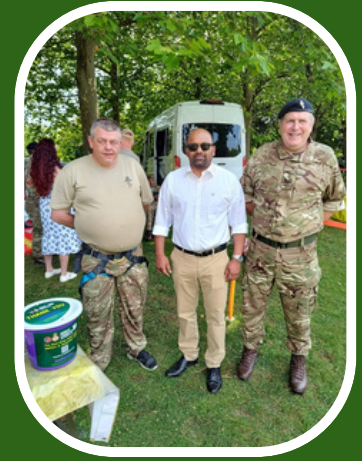
At Armed Forces Day in Ashford

The Government has also allocated £23 million to improve local bus services in Kent. A reliable bus service provides connectivity, and independence for all generations across the urban and rural areas. I have met with Stagecoach, and will continue to do so to raise the concerns of my constituents.