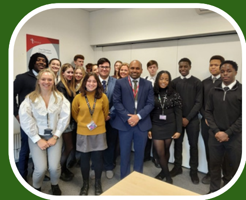
With students from the John Wallis C of E Academy during UK Parliament Week