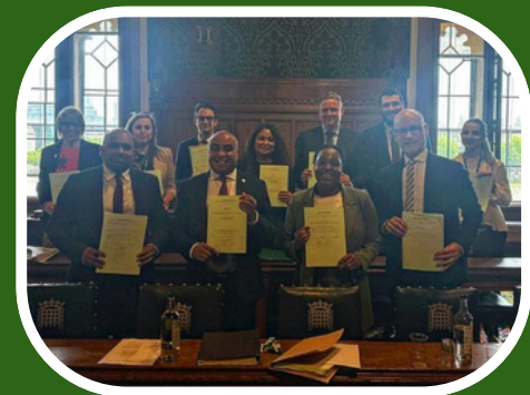
With my colleagues on the Mental Health Bill Committee