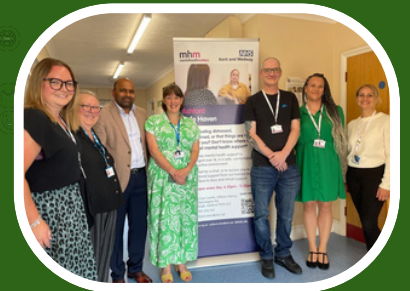
Visit to Ashford Safe Haven