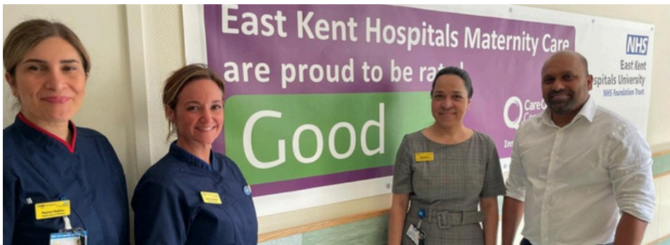
Meeting maternity staff at The William Harvey Hospital in Ashford

I have continued to meet with local healthcare leaders, such as the Integrated Care Board (ICB) and Kent and Medway NHS Partnership Trust (KMPT) – our local mental health and social care providers – to push for better healthcare facilities and provision for you.